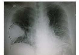
Lobar pneumonia, radiothorax

Current microbiological diagnosis of bacterial infections is mainly based on the inoculation of clinical specimens on specific media and the detection of microbiological growth. The time required to receive the first results vary from 24 to 48 hours. An alternative to the need to grow a microorganism consists in detecting the presence of its DNA in the clinical specimen. This diagnostic technique is faster than culture, but often lacks sensitivity and/or specificity. Therefore, its clinical relevance suffers from serious limitations. Another option, so far unexplored in clinical diagnosis, would be to detect the presence of bacterial specific RNA in the clinical sample. This technique is experimentally difficult because of the instability of the RNA molecule but has the fundamental advantages of detecting live bacteria (which actively replicates) and identifying genes that are expressed by the bacteria (such as antibiotic resistance genes). All these results can be obtained in less than two hours time. The clinical potential of such RNA diagnostic tests is very significant and could significantly improve the management of patients with infectious diseases.