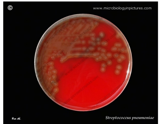
Streptococcus pneumoniae in a Petri dish

New and fast diagnostic tool for bacterial infection